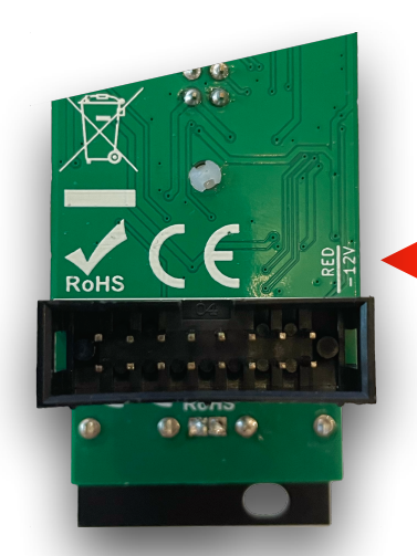
Rear side of the module

The module draws a maximum current of 32 mA from the +12 V rail and maximum 32 mA from the -12 V rail.